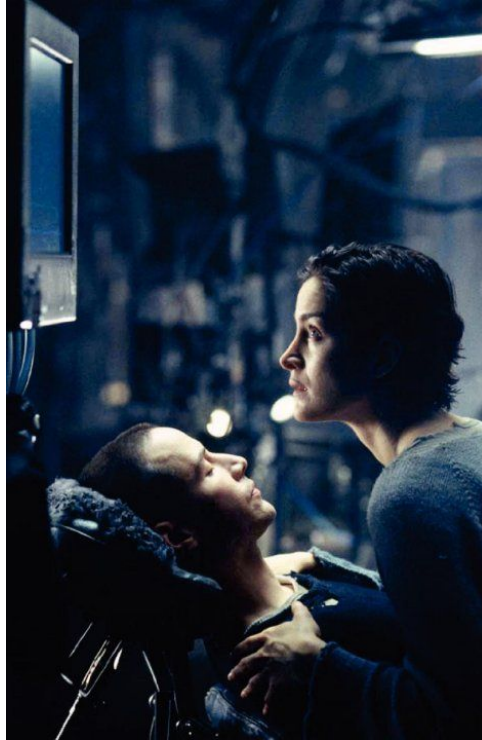
IMDb. Neo and Trinity in reality. Still image. IMDb . IMDb, 9 Sept. 2010. Web. 8 Jan. 2016.

Morpheus presents Neo with two pills, a blue pill and a red pill. Taking the blue pill would allow Neo to continue living the life he had before meeting Morpheus, leaving his mind open to believing that the world he is truly reality. The color blue can mean peace and tranquility 26 which correlates with the blue pill's effect in how believing that the world he lives in is reality could give him peace of mind. The theme here is that ignorance is bliss. Taking the red pill allowed Neo to come out of the virtual reality and find out the truth about what has happened to humanity. The color red can mean power, as it did in the The Wizard of Oz , and danger. The pill can be viewed as a source of power in how it led to Neo gaining the knowledge necessary for contributing to