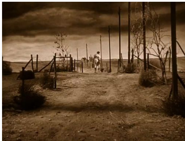
Mount Hollywood Art School. The state of Kansas as presented in the Wizard of Oz. photograph. Mount Hollywood Art School. WordPress.com, 7 Mar. 2013. Web. 8 Jan. 2016.