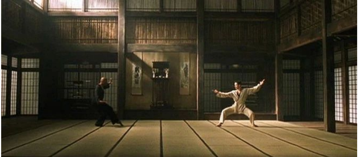
Killing Time. The fight scene between Neo and Morpheus. Still image. Killing Time . WordPress, 14 Mar. 2014. Web. 8 Jan. 2016.

Scenes taking place in reality have a bluish tint. The bluish tint indicates that the world in these scenes are occurring in the true reality. Blue is sometimes viewed as a depressing color as it is associated in some cases with sadness. 25 By the reality scenes having a bluish a tint, Neo along with the audience is able to get a feel of how grim life is actually is for the characters in the film. The theme of this aspect of the film is the harshness of reality.